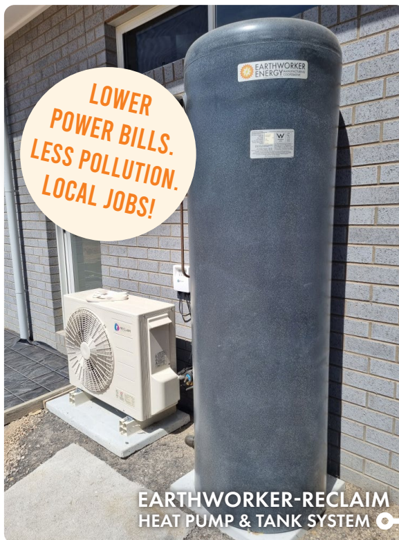
EARTHWORKER-RECLAIM HEAT PUMP & TANK SYSTEM