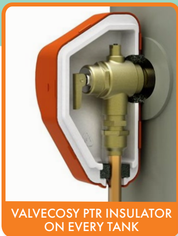
VALVECOSY PTR INSULATOR ON EVERY TANK

Cases with recycled content contain natural variation in colour/gradient