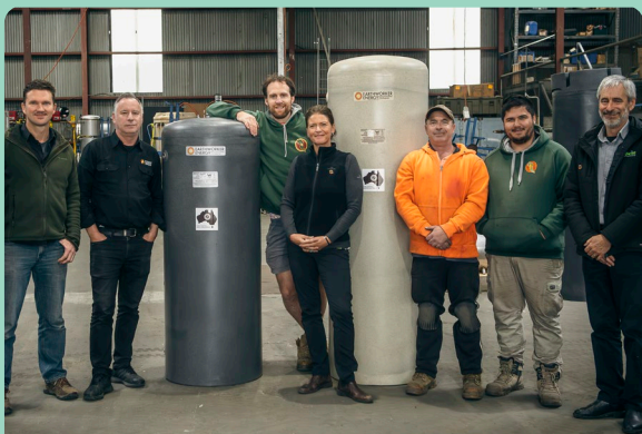
Earthworker Energy Manufacturing Cooperative in Morwell